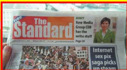
Hong Kong tabloids: Here's a snapshot from The Standard

I suggest that there should be proper supervision over illegal sexual items. I don't believe that control is harder than creation. If the police have tougher control over these obscene photos, it would be much better. It is not an excuse for the police to say "sorry, we don't actually have enough resources to put in": as the recent pop star nude photos scandal proved, the Police Force indeed have the resources. Alternatively, they could seek help from the government which has earned a huge fortune, right? Just ask Mr. Tsang!