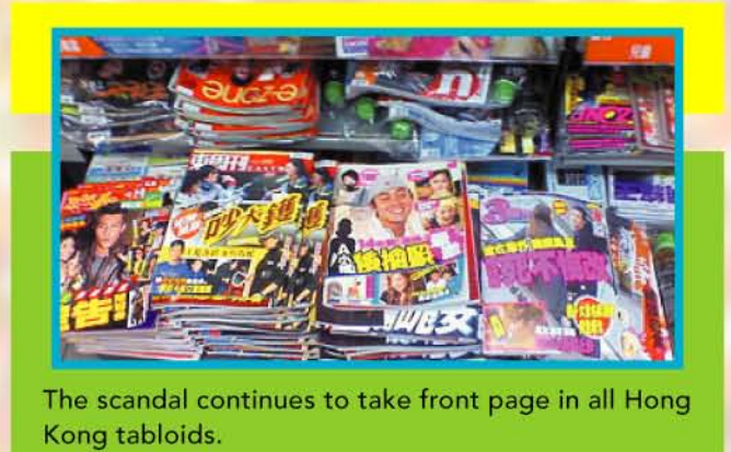
The scandal continues to take front page in all Hong Kong tabloids.

Firstly, the control and management concerning indecent and obscene items on the Net is not enough. The only thing being done is netizens are asked whether or not they are over 18 years old when logging on. If you are over 18, you can enter. If you aren't, you are supposed to close the browser. However, how many people would honestly answer the question? Ask yourself. Therefore, more should be done to protect the innocent from indecent and obscene articles, for