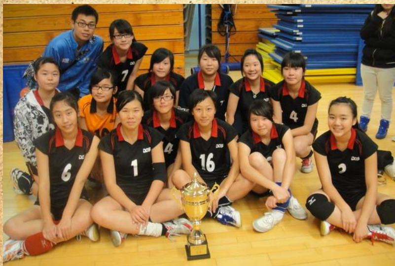
Our Volleyball Team

Some character traits can only be attained through experience and practice. Team sports can offer you an opportunity to train your attitude, hone your skills and develop your personal growth, which actually are crucial elements in our daily life. Want to pave the way for your future success? Let us join a sports team in the coming term!