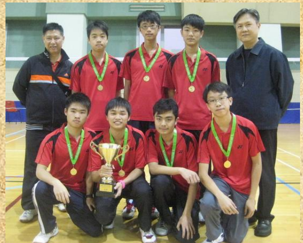
Our Badminton Team