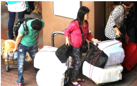
Parallel traders carrying bulky goods on trolleys.