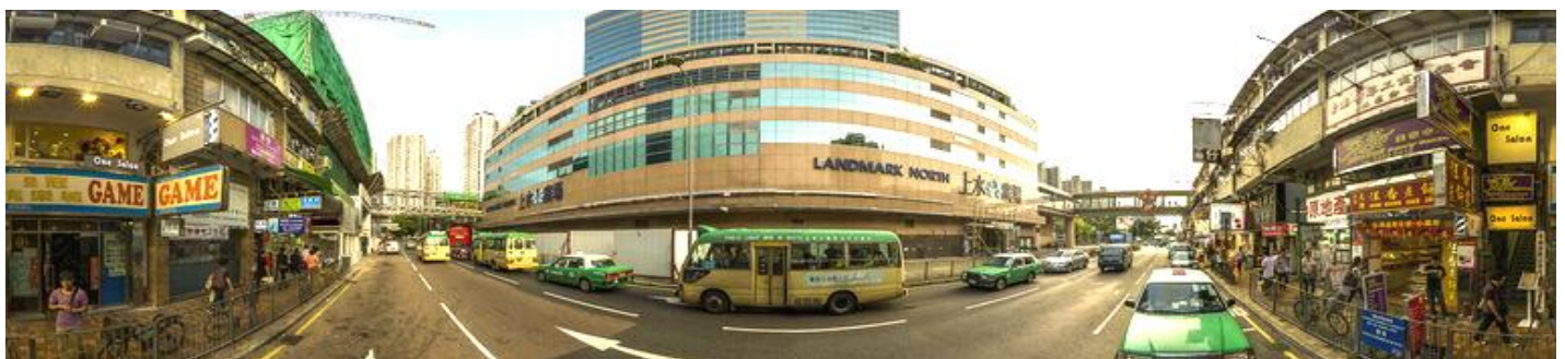
A panorama of Sheung Shui. In the middle is Landmark North, the largest shopping centre in the Northern District.

In my mind, Sheung Shui is a perfect mini society with both modern and village lives. I am glad that I am one of the members in the Sheung Shui community, enjoying the exchange of life styles and cultures. It does help inspire me for new and innovative ideas. Perhaps living in the same place for many years makes you numb, but don't judge a book by its cover. Try to care about our community from a different perspective and you will definitely find it free from your prejudice.