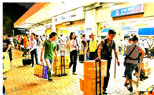
Sheung Shui Station is always full of parallel traders, during both day (left) and night (right).