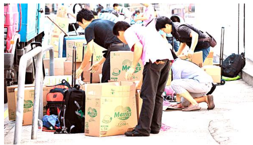
Parallel traders re-packing their goods in the street.

So, what problems are they causing to residents nearby? Parallel traders usually gather in the concourse area of Sheung Shui and Fanling Railway Station to distribute their goods. They cause a lot of menace and inconvenience to local residents. Worse still, as the Immigration Department has tried to crack down on the activity, some of the activities have been moved to other stations, which has caused more disturbance to more people in Hong Kong.