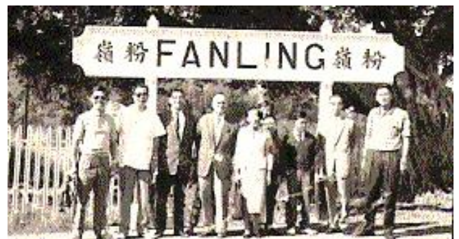
Sheung Shui Station today (left) and Fanling Station in the past (right).