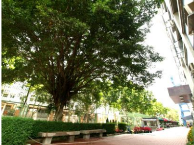
Our school is green! Do you recognize this place? It is the school entrance!