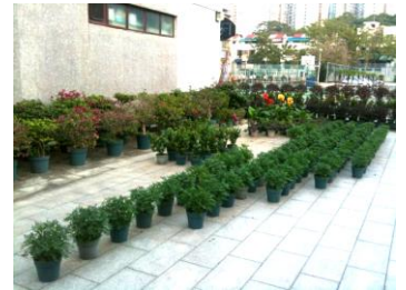
Have you been there before?

When I arrived at the garden, I could feel that it is a peaceful place. The garden was surrounded by trees. When I was there, the smell of many flowers, the fresh air and the tranquility there made me feel really comfortable. All my pressure has gone! It is a good place to relax.