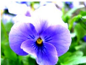
A shrinking violet is a shy person.

Meaning: If something isn't a bed of roses, it is difficult. Example: Achievement is always no bed of roses so we should work hard.