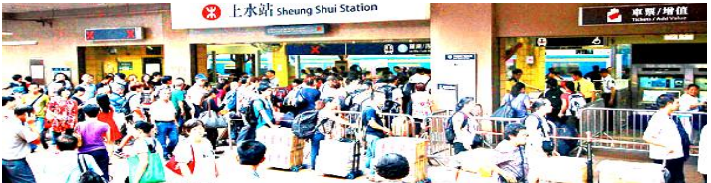
Parallel traders line up waiting to enter Sheung Shui Station.