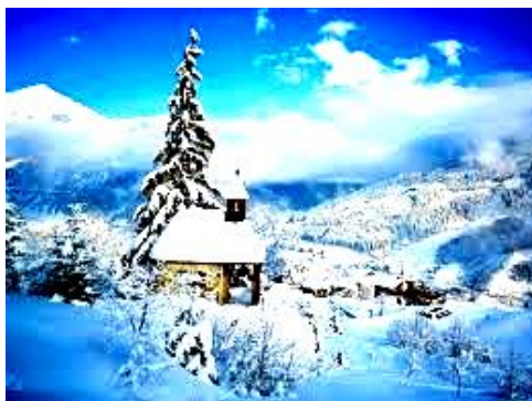
Bad Gasten, Austria, a famous location for skiing.

WS: How about the difference between Hong Kong and Austria in general?