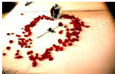
No bed of roses means things are not easy.