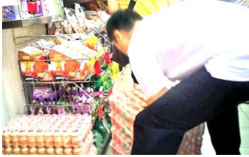
Parallel traders stocking up Yakult.

First, let us look at why they are so rampant. As we all know, the living standard in Hong Kong is higher than Mainland China. Many Chinese residents always come to Hong Kong to buy daily goods like food, drinks and milk powder. They also bring electronic products like smart phones and computers.