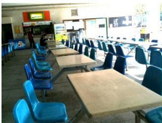
This must be a familiar place for many of you readers.

I think you know the answer. It is the tuck shop. I can buy delicious food there like udon, fishballs, chicken fillet and a lot of other yummy food. They are provided in the second recess, lunch break and after school. My favourite is the egg sandwich with mayonnaise. It is a bit sour and really healthy. Also, it is not expensive. Actually a sandwich costs $15 elsewhere but the sandwiches there only cost about $7, which is a great price.