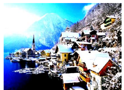
Hallstatt, Austria, renowned for its scenery.

A: In Austria, the school time is 8am to 1pm but in TKP school hours are longer. Also, TKP teachers are stricter than those in Austria. For example, they take care of the private lives of students. However, in Austria, the job of teachers is only to provide knowledge.