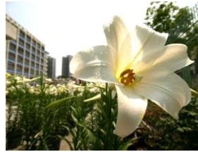
Beautiful lilies (left) and sunflowers (right) in the garden.