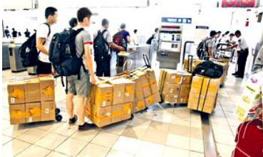
Parallel traders with boxes line up outside Sheung Shui Station.

So, what problems are they causing to residents nearby? Parallel traders usually gather in the concourse area of Sheung Shui and Fanling Railway Station to distribute their goods. They cause a lot of menace and inconvenience to local residents. Worse still, as the Immigration Department has tried to crack down on the activity, some of the activities have been moved to other stations, which has caused more disturbance to more people in Hong Kong.