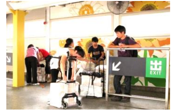
Parallel traders distributing goods on the platform.

These parallel traders transport different kinds of goods to and fro Hong Kong and Mainland China many times a day, with each stay not more than two hours. According to a parallel trader, they do this just because they want to earn more money and make a living. Most of them are poor and find it hard to make ends meet.