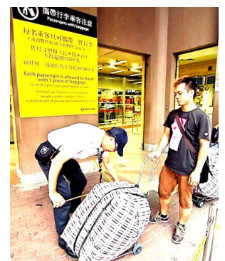
The MTR has set a weight and size limit for passengers' luggage.