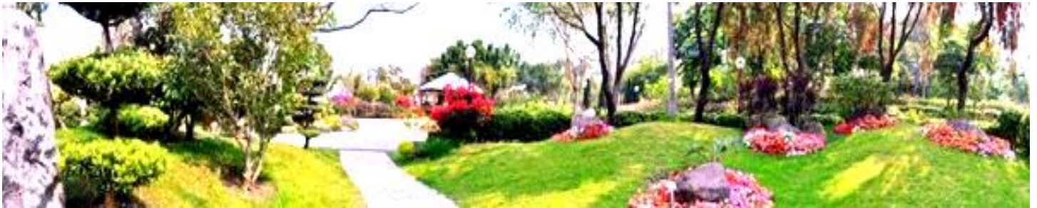
A panorama of Northern District Park, a green lung in the area.

I have been living in Sheung Shui since I was born. It's where I spent most of the time of my life. From my impressions of Sheung Shui, it isn't a bad place at all. There are many nice places in Sheung Shui. I think the best part of Sheung Shui is the greenery. It's full of different types of trees and flowers. I think Sheung Shui is one of the new towns in Hong Kong that has the most trees. They say green plants not only improve air quality, make the environment beautiful, but also make people relax. Imagine walking down the street with plants all over you. It's something you could easily do in Sheung Shui or even Fanling, but not in other developed districts.