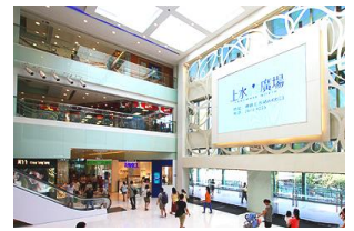
Ng Tung River (above) and Landmark North (below)

Compared to Central or Kowloon, Sheung Shui is worlds away. Having said that, it is also well-developed with the effective government policies so it is now modern and convenient. We can go to the MTR station in just a few steps. Moreover, there is a variety of shops in the shopping mall and the streets because of the lower rent. To cite some examples, the traditional stores and the well-known shops like Crocodile, which not only give us many choices, but some traditional stores also can be retained. Although Sheung Shui is at the periphery of Hong Kong, it is still easily accessible with the well-developed transport system.