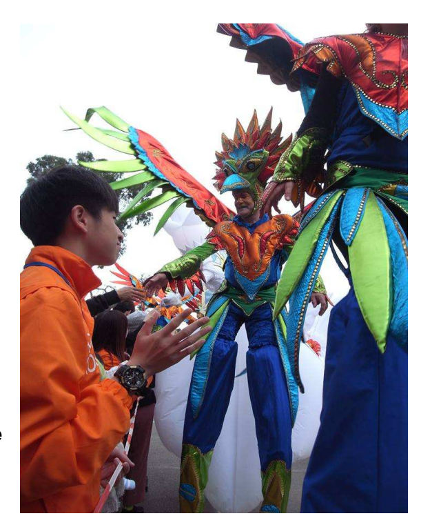
Chinese New Year Parade