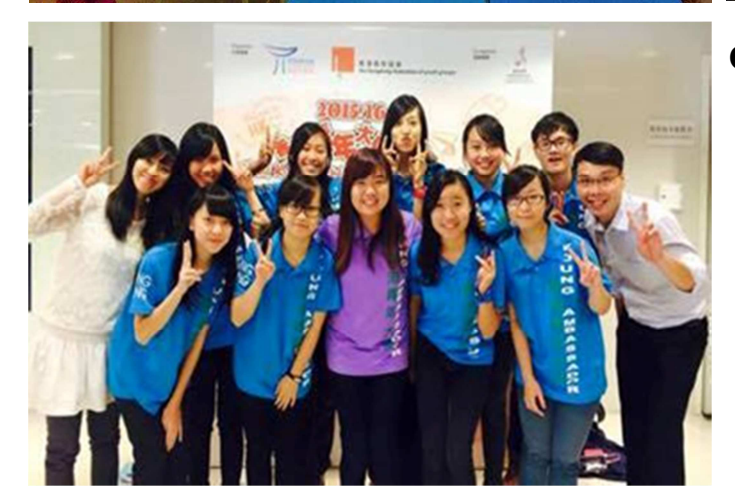
Games in Cheung Chuk Shan College